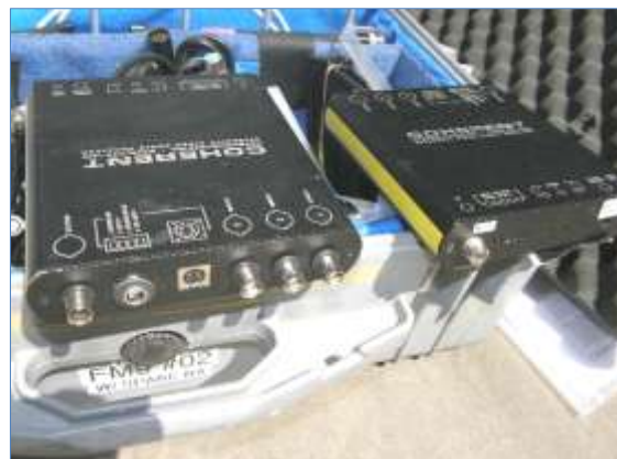
Diversity receiver and spare