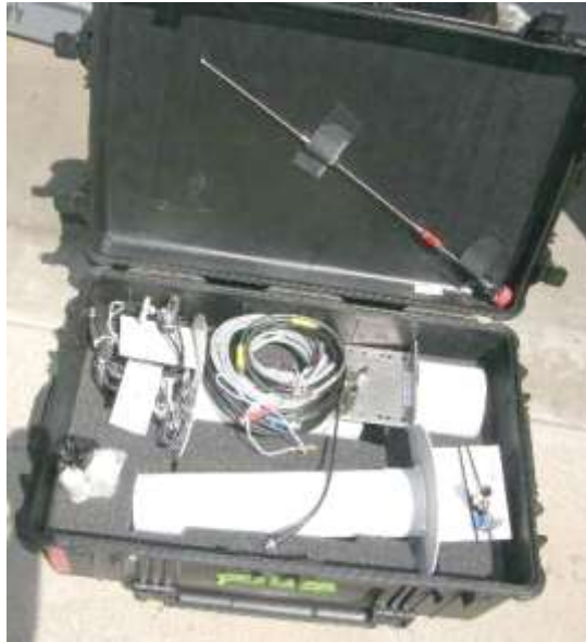
2 Helix+ Cloverleaf

Barely used, modified to professional standards – rock bottom prices Call for prices for Kit with many adapter cables