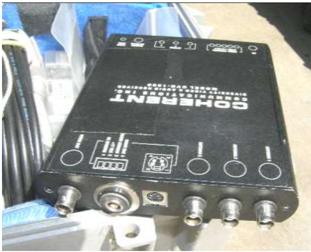
Modified power plug on Diversity Receiver