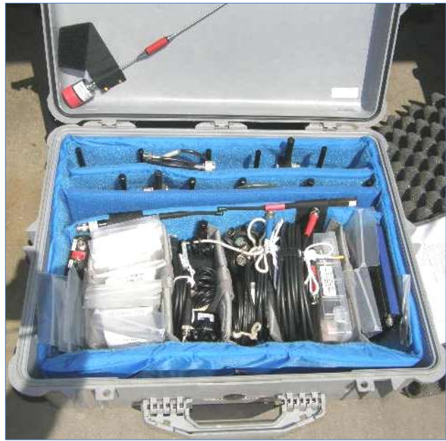
Transmitter and Receiver + Yagies