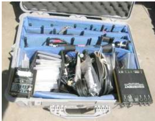
Time code Transmitter + Receiver + Yagi antenna