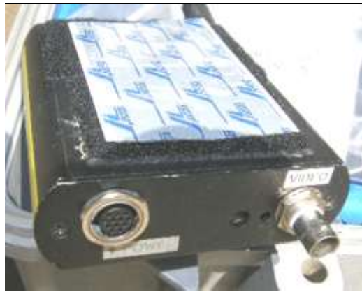
Transmitter with heavy duty BNC in