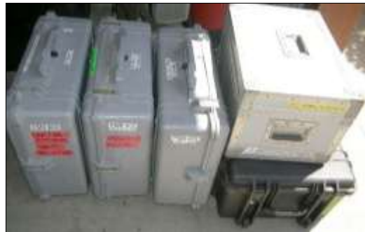
3x Tx+Rx Kits + Helix and Cloverleaf

We have rental packages start at $300.00 per day.