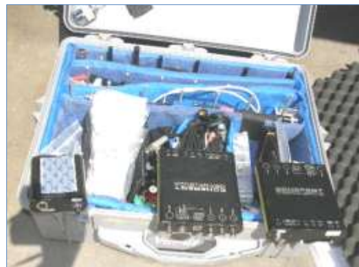
1 Transmitter + 2 receiver